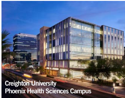
Creighton University Phoenix Health Sciences Campus