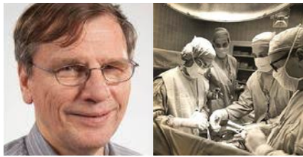
World-Renowned Pioneer in Cardiothoracic Surgery

Professor of Cardiothoracic Surgery, Monash University and Alfred Health