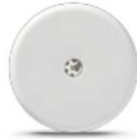
Freestyle Libre 2 PLUS