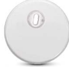
Freestyle Libre 3 PLUS